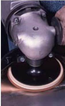
Surface blending on stainless steel