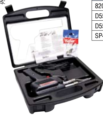
Part No. D550PK