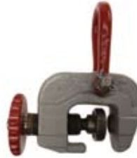
Part No. 6421000