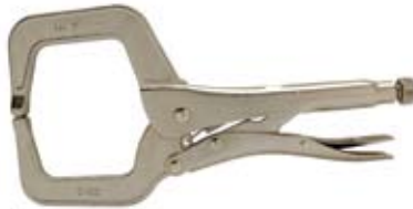
Part No. C11CCV