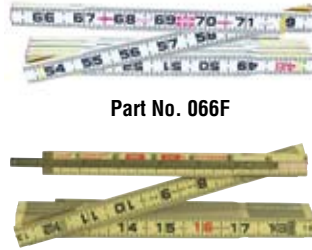
Part No. 066F