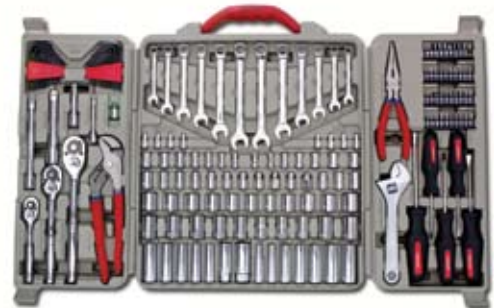
Part No. CTK170MP