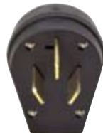
Part No. 0080