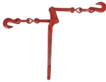
Part No. 6203604