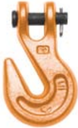
Part No. 4503315