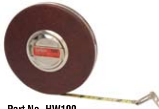
Part No. HW100