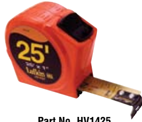
Part No. HV1425