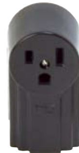
Part No. 1252