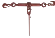
Part No. 6207803