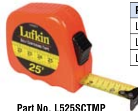
Part No. L525SCTMP