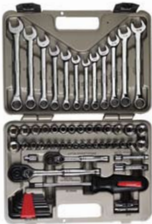
Part No. CTK70MP