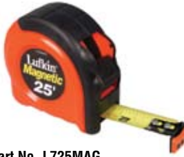
Part No. L725MAG