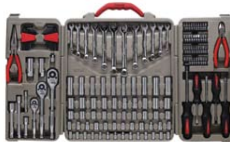
Part No. CTK148MP