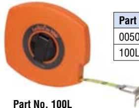
Part No. 100L