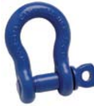
Part No. 5410605