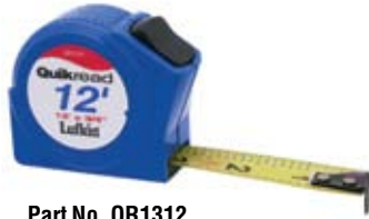
Part No. QR1312