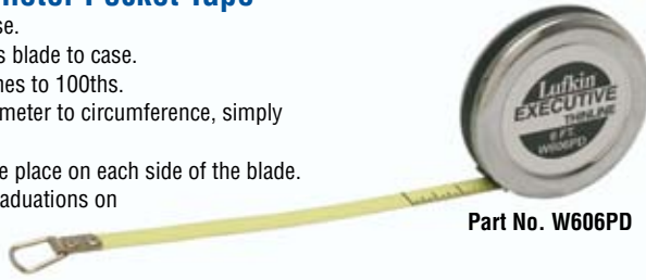
Part No. W606PD