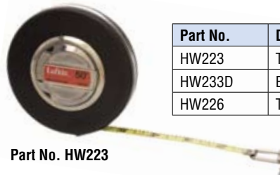
Part No. HW223