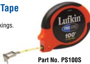
Part No. PS100S