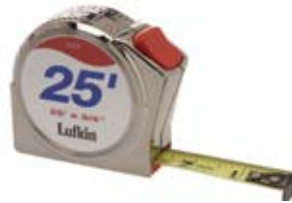
Part No. 2325