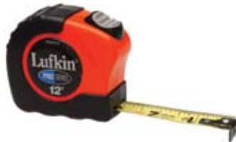
Part No. PS3312