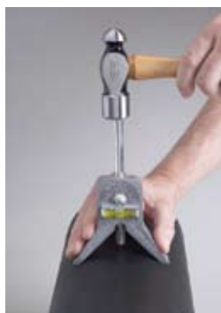
Part No. 0721-0005

The Jumbo Centering Head is for pipe 1" diameter and up. It has an 8" Y-type head, and a DSL. A spring loaded hardened centering pin eliminates the need for a hammer. Just make the alignment and press the trigger.