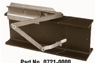
Part No. 0721-0000

The Curv-O-Mark® Contour® Marker is a compact, time-saving tool used to lay out pipe and structural steel joints. Laterals at any angle, tees, crosses, elbows—any type or size of joint can be quickly and precisely laid out. No more complicated mathematical formulas. No more cut and try. No more needless material waste.