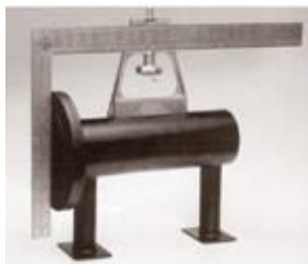
Square not included

The Flange Aligner Base is made from lightweight, durable aluminum.