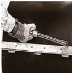
Part No. 0721-0025

Designed for use with a burning torch or as a straight edge, the Burning Guide is cast of strong, durable material to withstand heat and spatter. The tool's base has three 30 lb. pull cast-in magnets for use in any position. A 24" blade on a raised plane is standard.