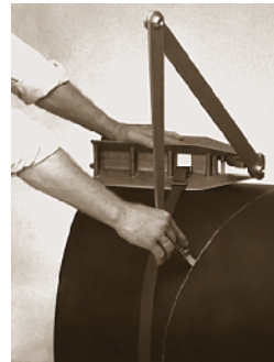
Part No. 0721-0003

A larger version of the Contour® Marker, the Jumbo Contour® Marker (JCM) has been developed for use in the layout of large diameter pipe, from 8" to 48". With its structural adaptor, the JCM can be used in the layout of extremely large structural steel members up to 48 in. wide.