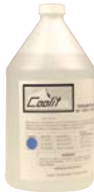
Part No. 16-25501

For maximum equipment performance, always use our special coolant formulas in place of tap water. With each coolant you are free from the hazards of damaging mineral deposit build-up in equipment, freezing water lines, and high frequency loss from conductive tap water.