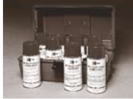
Part No. 0-2003-K