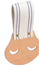
Part No. 5461T