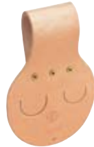
Part No. 5459T