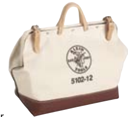
Part No. 5102-12