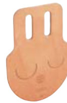
Part No. 5460