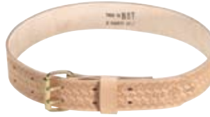
Part No. 5415