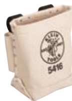
Part No. 5416