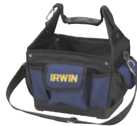
Part No. 420-004