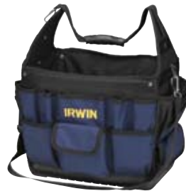
Part No. 420-002