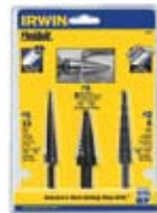
Part No. 10502