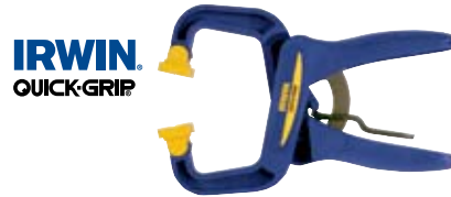
Part No. 59200CD