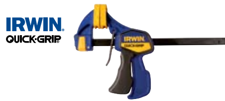
Part No. 506QC

Soft but durable pads prevent marring of work. Quick release trigger and pistol grip action adjusts and tightens with just one hand.