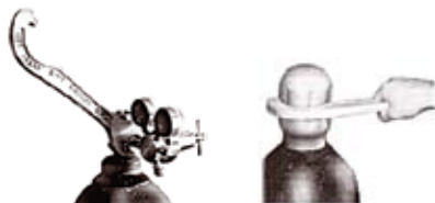
Part No. 1027

Combination wrench 9" long has a total of 10 openings from 7/16" to 1-1/8" including a boxed opening for B and MC acetylene valves and a socket for commercial acetylene cylinders.