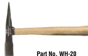
Part No. WH-20