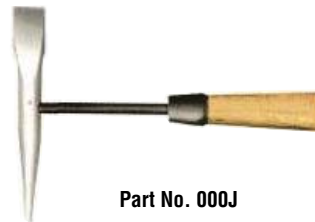
Part No. 000J