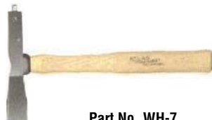
Part No. WH-7

Part No. 0026 - 13" Wood handle and wedge for long neck