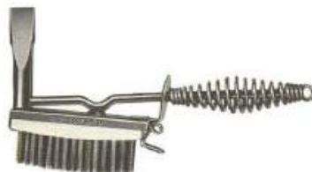
Part No. 000A