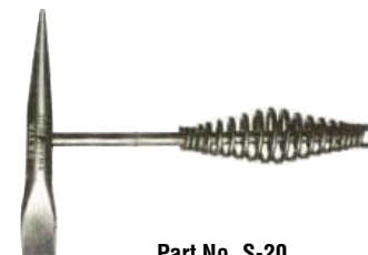
Part No. S-20