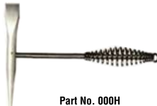
Part No. 000H